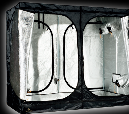
240 cm 120 cm 200 cm DR 240W