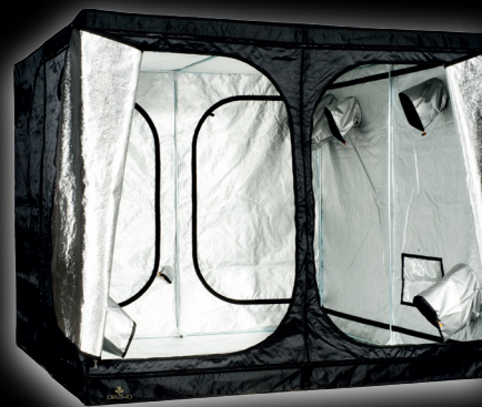
240 cm 240 cm 200 cm DR 240