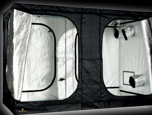
300 cm 300 cm 200 cm DR 300