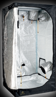
90 cm 90 cm 180 cm DR 90