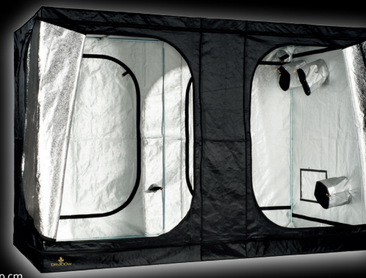
300 cm 150 cm 200 cm DR 300W