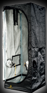
60 cm 60 cm 160 cm DR 60